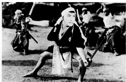
決闘高田の馬場 西武映画社 製作